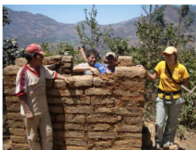
Construction of latrines